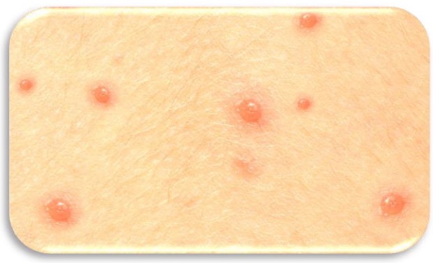
The spots fill with fluid and may burst.